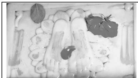
'Ever blessing' Padukas of Baba.