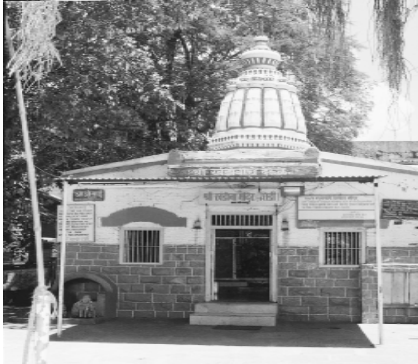
Khandoba Mandir, Shirdi